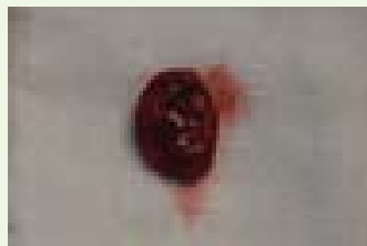
Fig 3: Removed cyst with its lining