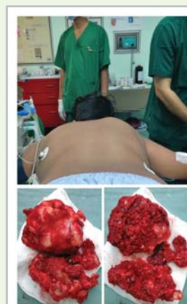
Surgical removal of the osteochondroma

There was a lobulated/ cauliflower like bony mass of about size of 5 inches x 4 inches x 3 inches with cartilage cap covered by fibrous perichondrium and continuous with the periosteum of the underlying right scapula, extended from posterior surface of medial angle, part of supraspinatus fossa, half of scapular spine and part of infraspinatus fossa which was excised and sent for histopathological examination. His post-operative period was uneventful.