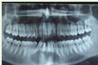
Fig1: X-ray OPG before treatment

In the above mentioned case, surgical inoculation of the cyst was done under GA with bone guttering. Follow up X-ray after 6 month showed good bony healing and no sign of the recurrence at the affected area.