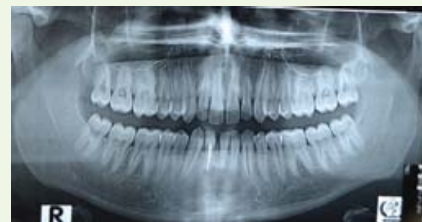
Fig 4: Follow up X-ray OPG after 6 months