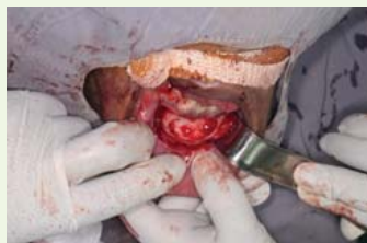
Fig 2: Inoculation of the cyst with its lining